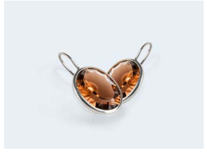
Handcrafted Sterling Silver Earrings

With a firm focus on the discerning tastes of the Colombo and export markets, the Akeena Collection brings together the very best in silver jewellery which is perfectly complemented by an array of eye-catching precious and semi-precious Ceylon gemstones.