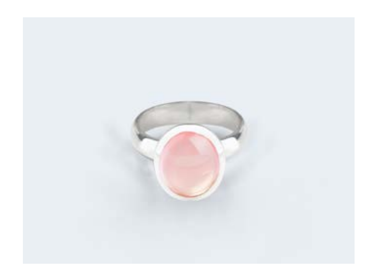
Rose Quartz Sterling Silver Ring