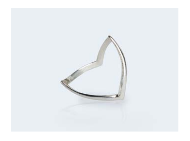
Sterling Silver Heart-shaped Ring