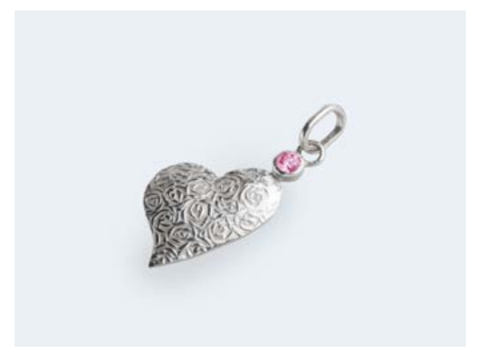
Sterling Silver Engraved Heart Pendant