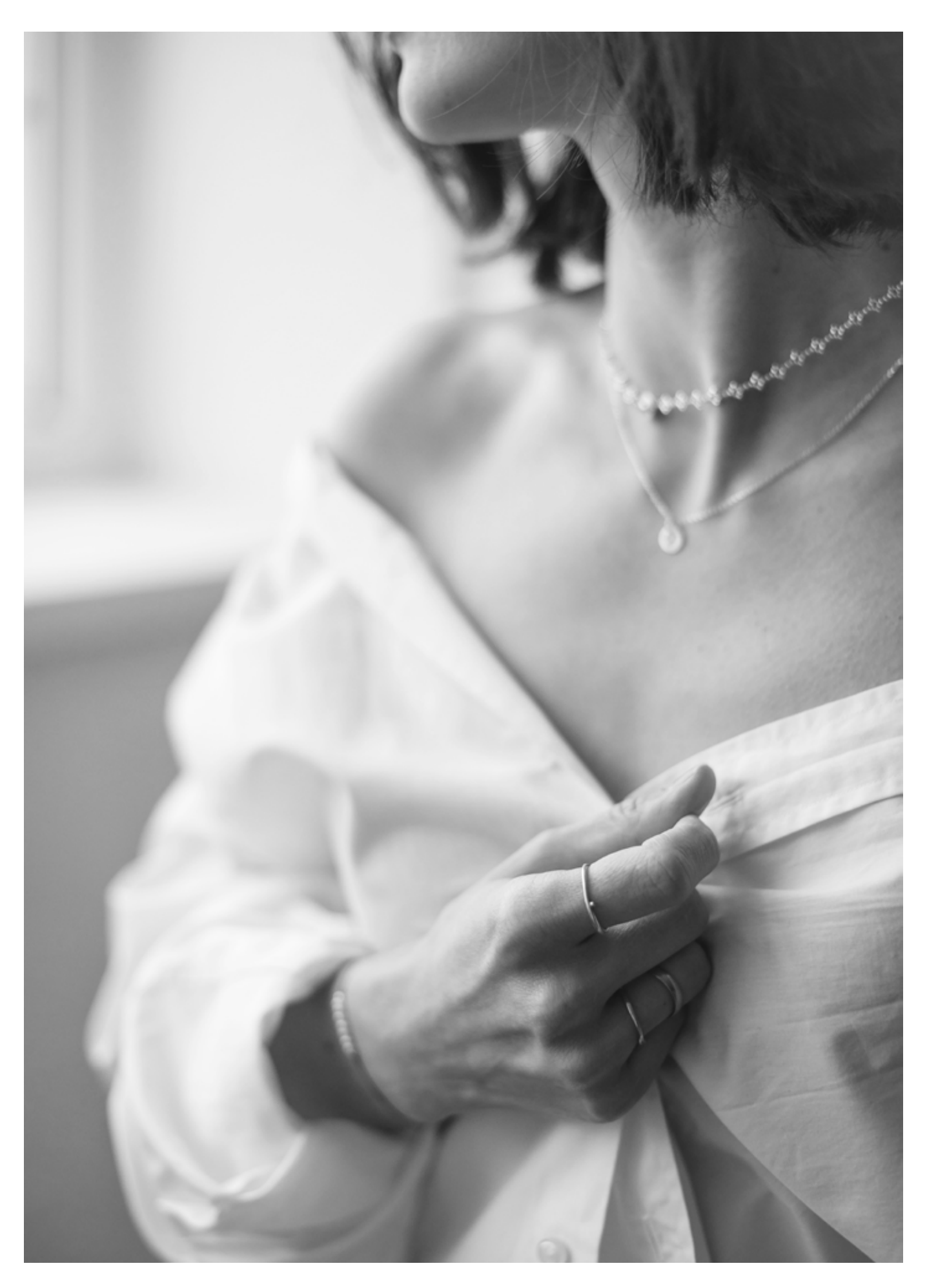
Create moments that linger in one's memory with a product that will certainly add to the allure of the wearer.