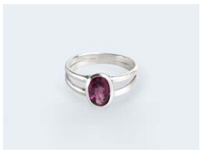
Red Garnet Sterling Silver Ring