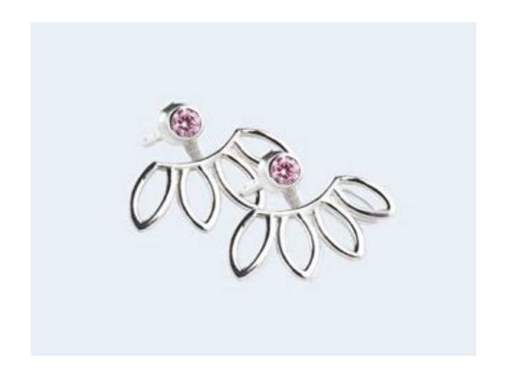
Nelum Flower Sterling Silver Earrings