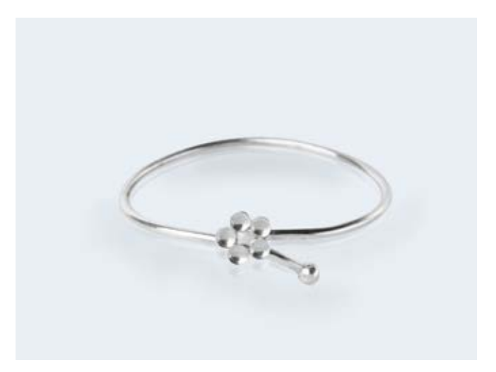
Handcrafted Sterling Silver Flower Bangle