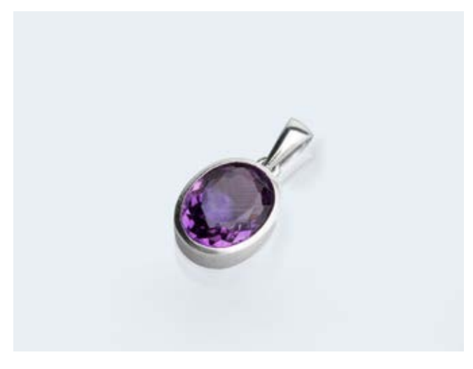
Sterling Silver Amethyst Pendant