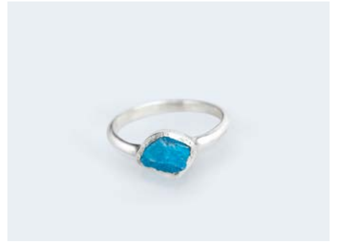
Rough Cut Blue Topaz Sterling Silver Ring