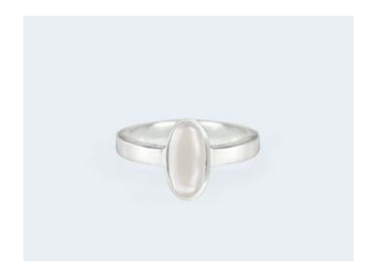
Moonstone Sterling Silver Ring