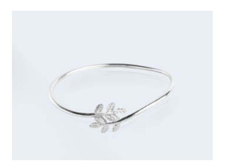
Handcrafted Sterling Silver Double Leaf Bangle