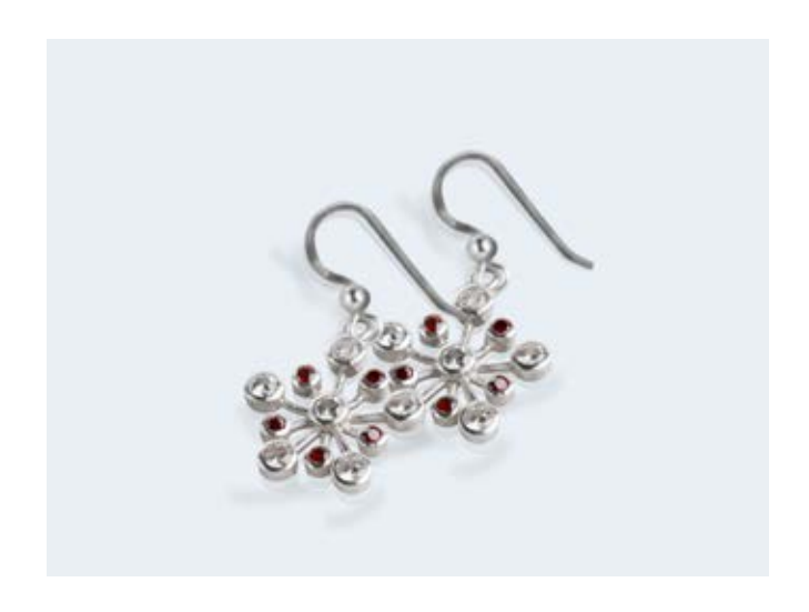
Snowflake Sterling Silver Earrings