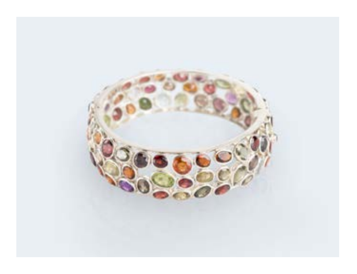
Antique Ceylon Stoned Sterling Silver Bangle