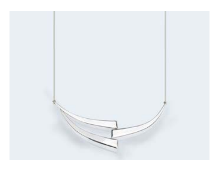
Sterling Silver Zig Zag Necklace