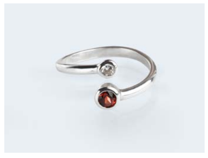
Cinnamon Stone/ American Diamond Sterling Silver Ring