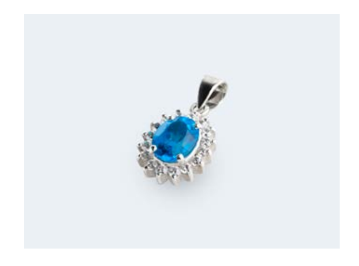
Sterling Silver Blue Topaz Flower Pendant