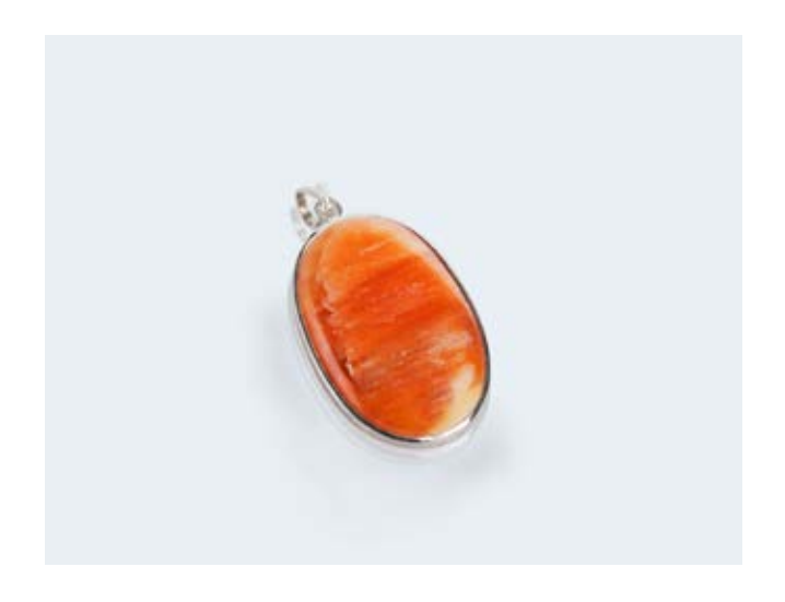
Sterling Silver Carnelian Pendant