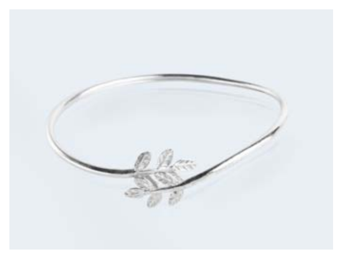
Handcrafted Sterling Silver Bangles