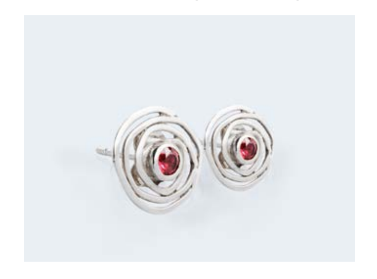
Road to Eternity with Cinnamon stone Sterling Silver Earrings