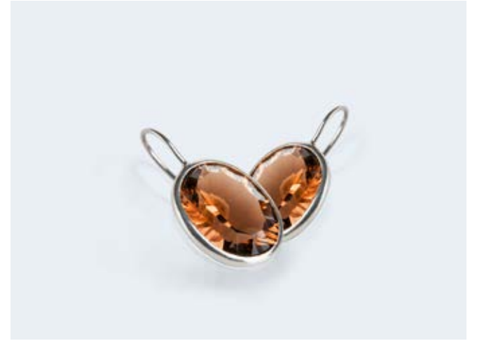
Smoky Brown Quartz Sterling Silver Earrings