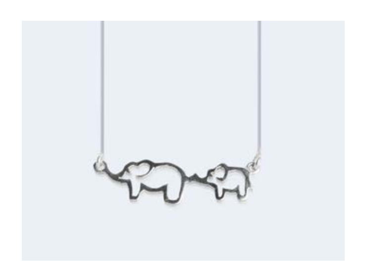
Sterling Silver Elephant Necklace