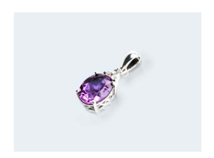
Handcrafted Sterling Silver Pendants and Necklaces