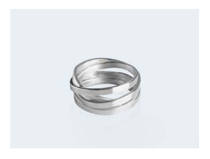
Handcrafted Sterling Silver Rings