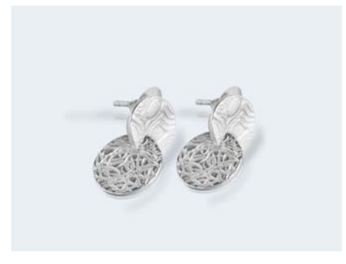
Engraved Two Circle Sterling Silver Earrings