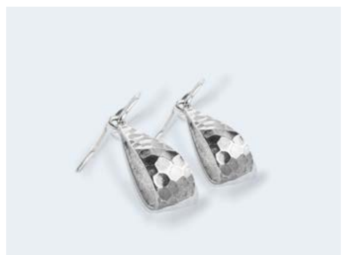
Sterling Silver Earrings